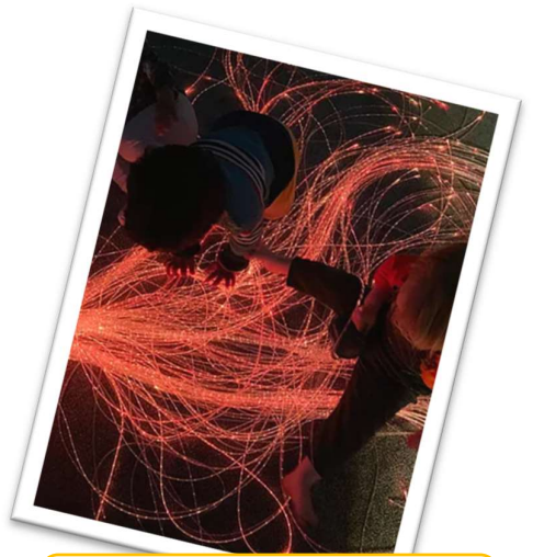
Our Sensory Room