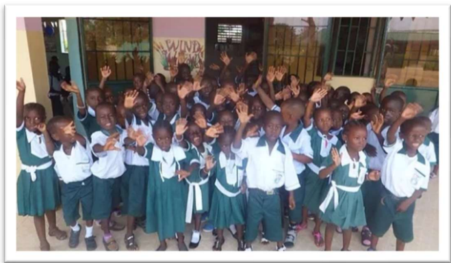
Our Twin School in The Gambia