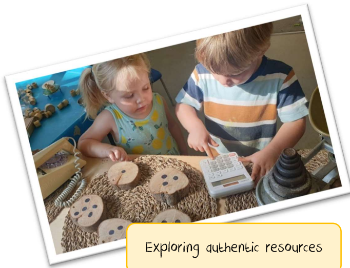
Exploring authentic resources