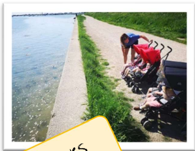
Enjoying the outdoors